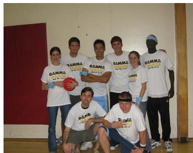
Fall 2005 Winning Team

It's that time again! Gamma games will be held on Wednesday, February 8th, 2006 at the student pavilion from 6:00p.m. to 8:00p.m. Post-game Celebrations will be held at the Draught Horse.