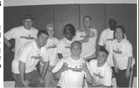
Last Semester's Winners

Join the Student Affairs team and your fellow members for the first social event of the semester— Gamma Games!