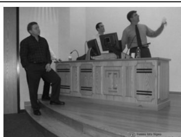
This is actually more fun than it looks like.