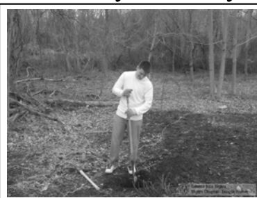
Re-enact first-hand the events in the book "Holes"!