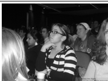
Someone's enjoying it at least.