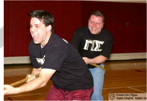
1. Grab a hold of your future...or at least learn how to pull heavy things.