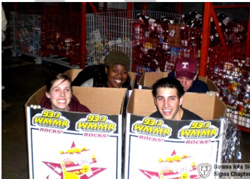
5. Give back to the community!