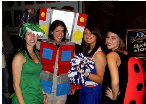
3. Make Relationships.... and learn how to TRANSFORM!