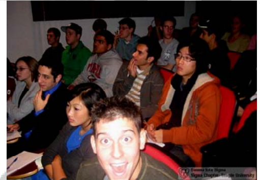
4. Gain invaluable information from industry professionals!