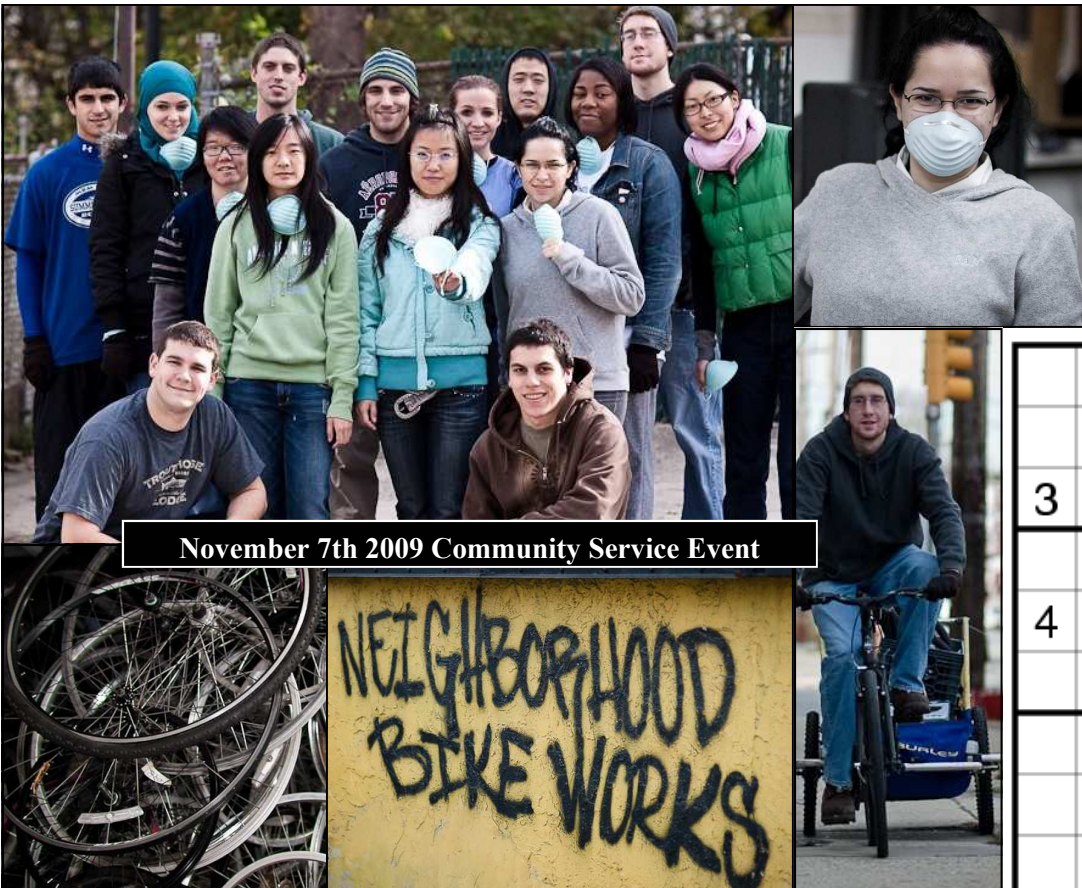
November 7th 2009 Community Service Event